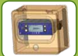
Trailer Chassis Mount