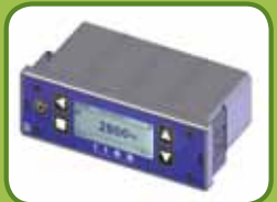
DIN Radio Mount

An audible sounder and on-screen message alerts the driver if the body is raised.